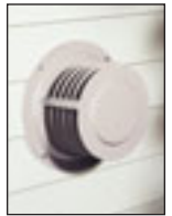
Shown: Standard Direct Vent Cap mounted on outside wall