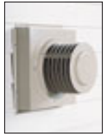
Shown: Vinyl Siding Vent Kit Accessory for Direct Vent Units