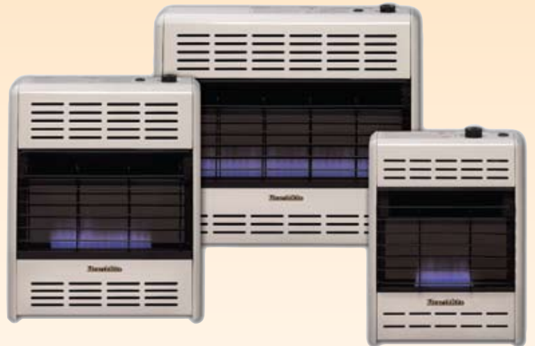
Blue Flame Vent-Free Gas Heater