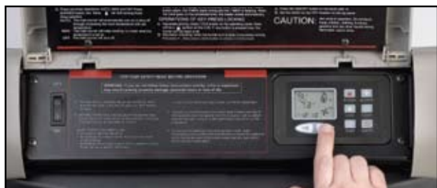
Touch Pad Controls

Zone heating with state-of-the-art control! This efficient room heater feature concealed touch pad controls and a sleek, injection molded exterior that stays cool – even as the heater warms your room.