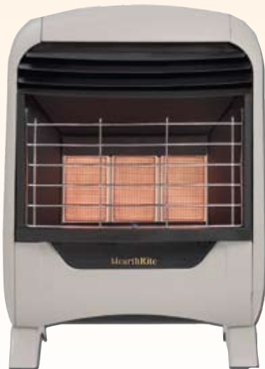
Radiant Touch Pad Vent-Free Gas Heater